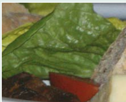
What's this? ... (see back page)

Everyone has something to say - what we're doing, where we've been, how we're feeling. This page in the newsletter is going to be a 'regular', and specifically for clients of the Aldingbourne Trust to tell their stories and share their experiences. We're calling it OurSpace , but you might have other ideas - it's your page, so do please let us know.